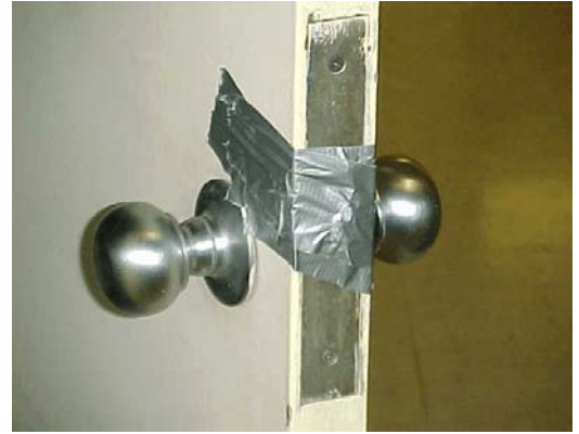
Fire door latch improperly taped to hold the door open

A fire door and its frame can often be identified by a plate affixed to each, indicating the laboratory approval and the duration of fire rating. Painters must avoid painting over these plates, as this could prevent future determination of whether or not the doors and frames are appropriately fire-rated.